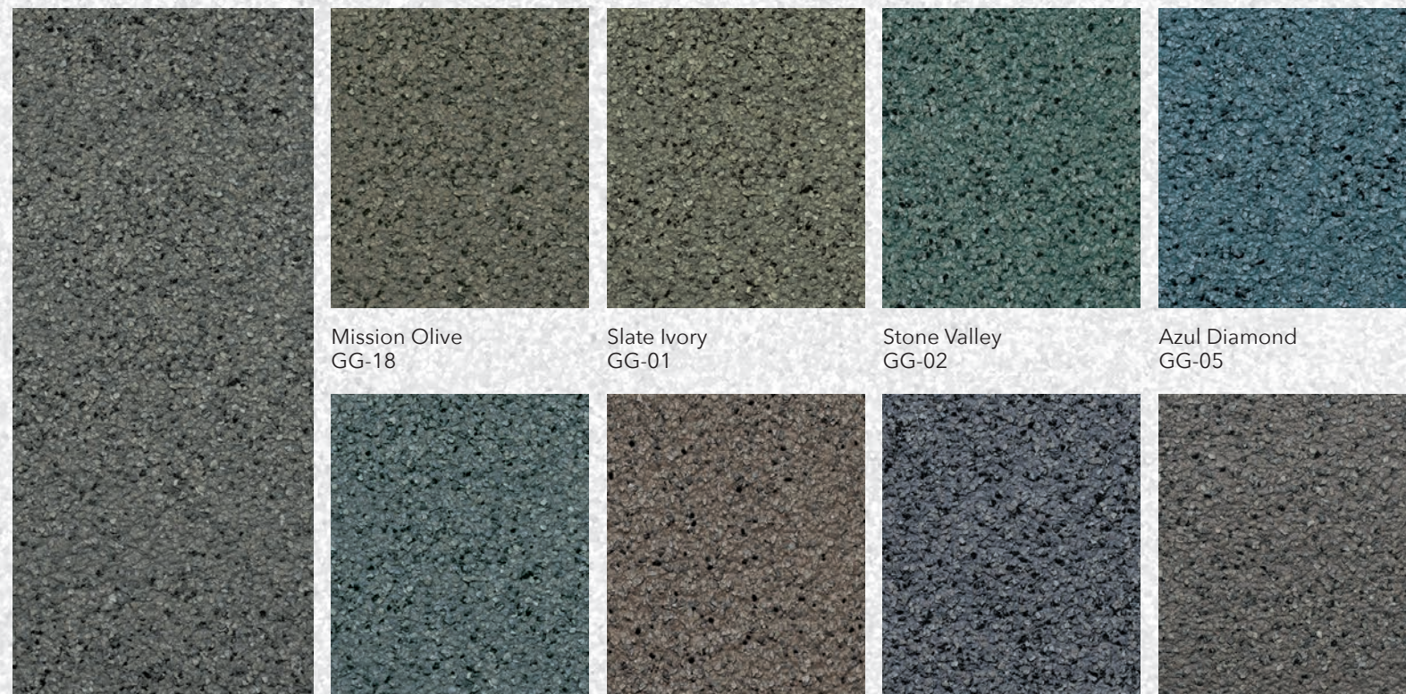
Gray No. 650 Mineral Gray GG-17 Atlantic Topaz GG-03 Galaxy Quartz GG-08 Ornamental Gem GG-07