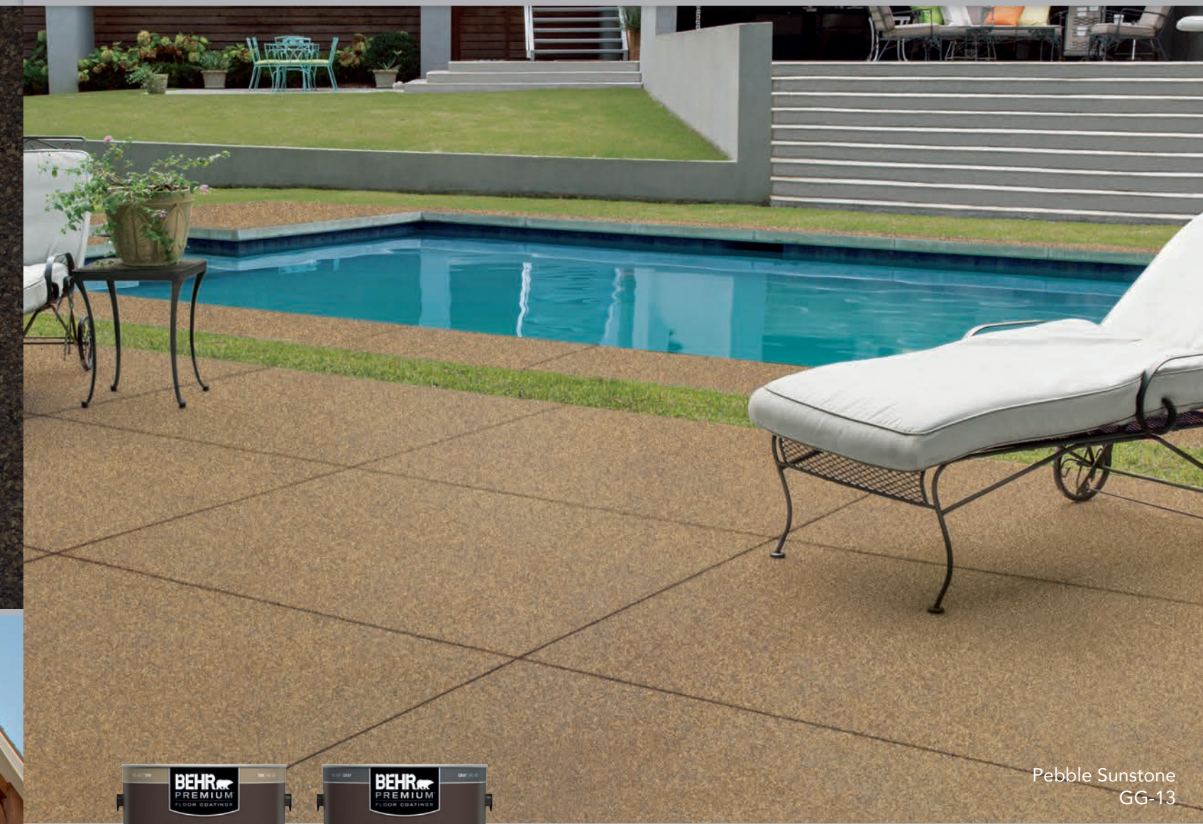
Pebble Sunstone GG-13