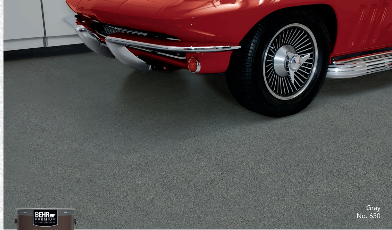
Gray No. 650