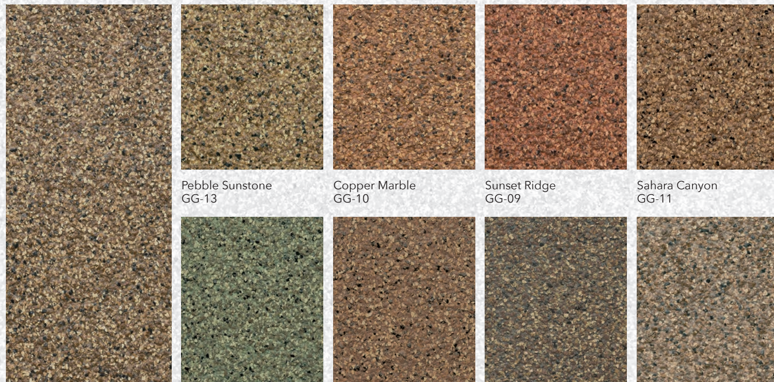
Tan No. 655 Imperial Jade GG-12 Baltic Stone GG-16 Autumn Mountain GG-14 Amethyst GG-15