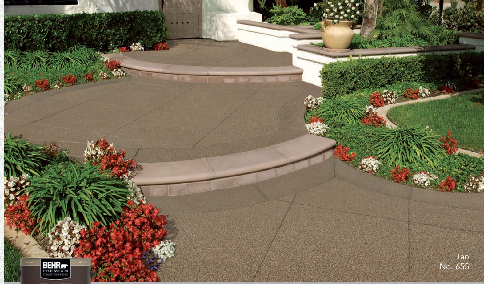
Tan No. 655